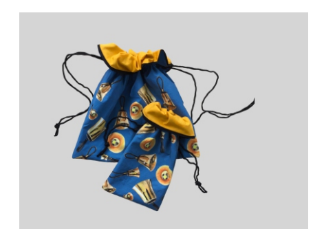
Mini drawstring $12.00 Med drawstring $15.00