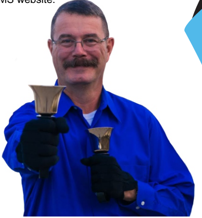
July 2021 Board Meeting at Bowness Park

AFOL (Adult Fan of Lego) Avid roller coaster junkie (have been on nearly 900 differentcoasters in 15 countries) Created and maintain several websites - including ellocoaster.com , jimwinslett.com, and the BRHMS website.